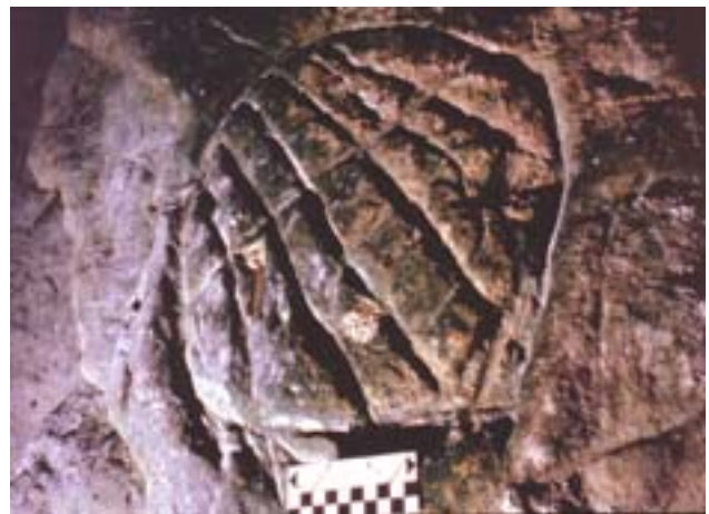
Figure 2. Karake-style circle with internal design, 4 m above floor, Paroong Cave, Mt Gambier.