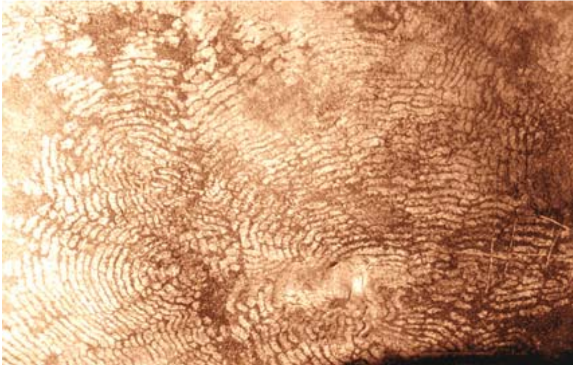
Figure 5. 'Fossilised' finger flutings on the ceiling of Yaranda Cave, near Portland, Victoria, over 20 000 years old.