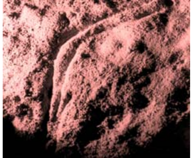
Figure 8. Boomerang-shaped petroglyph on the ceiling of Ngrang Cave, near Portland.

For instance, Australian archaeologists have been remarkably aloof even to the most obvious function of rock art, that of a cultural determinant through its relative permanence and, frequently, prominence. Many of the country's major rock art sites may have been in use over tens of thousands of years, by people of very diverse cultural affiliations or conventions, who adopted and often adapted previous rock arts for their graphic traditions. Instead of capitalising on the potential of rock art to illuminate cultural dynamics (ranging from extreme conservatism to stylistic volatility), archaeologists have resorted to