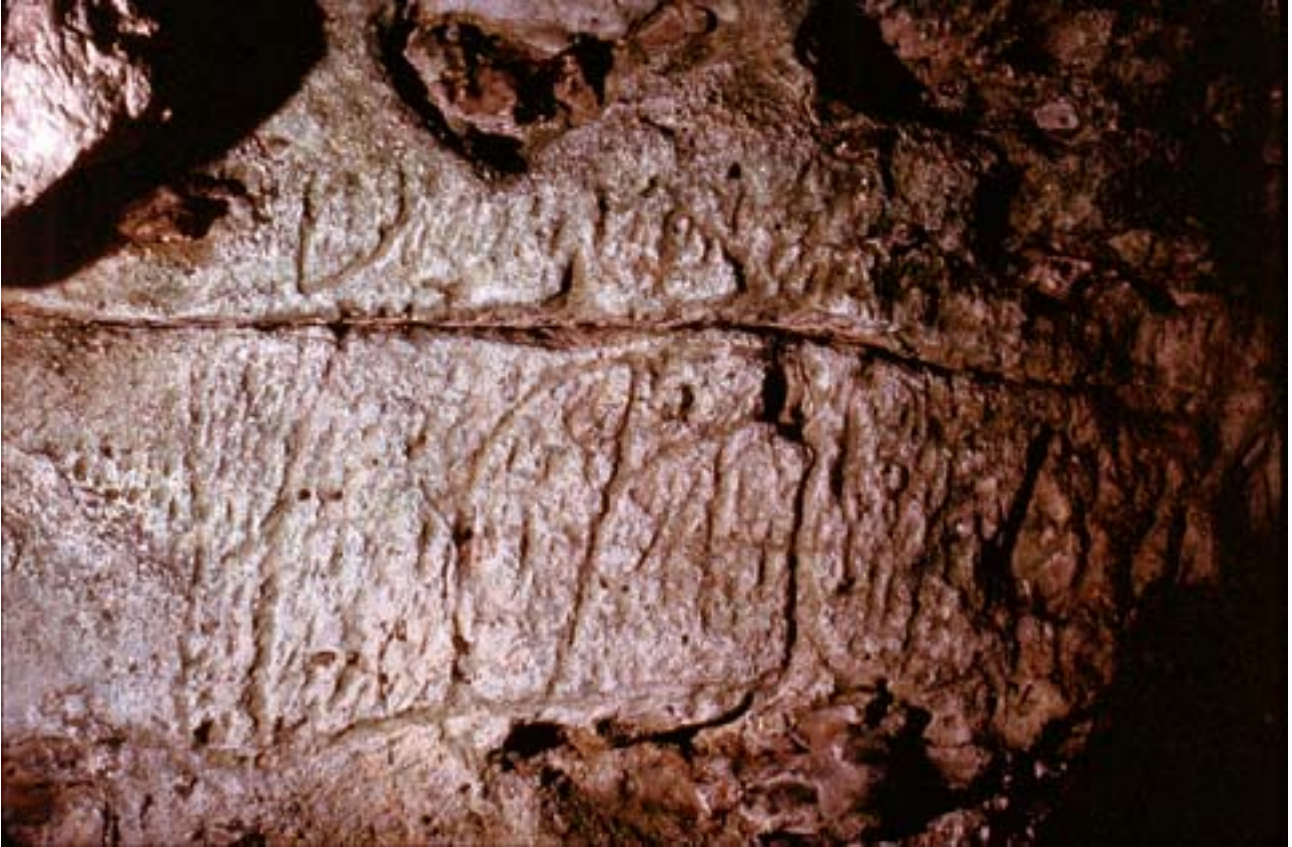
Figure 9. Chert mining evidence (see partly removed silica nodules in top of picture) and part of major petroglyph panel on southern wall of main chamber, Karlie-ngoinpool Cave, near Mt Gambier. This cave contains the world's largest concentration of nonconic cave art.

lished in Australian Aboriginal Studies 1990, Number 2. It has been provided on the occasion of the Hamilton AURA Inter-Congress Symposium in October 2003.