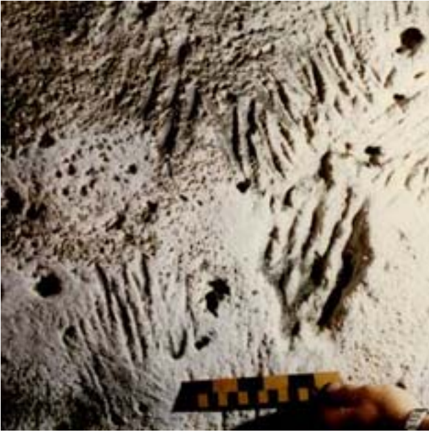
Figure 7. Tool markings on west wall of Koongine Cave, near Mt Gambier.

Gambier was involved in our project with great enthusiasm in the late 1980s, monitoring and strongly supporting our activities, and providing valuable guidance in matters of research priorities and preservation (Bednarik 1989b).