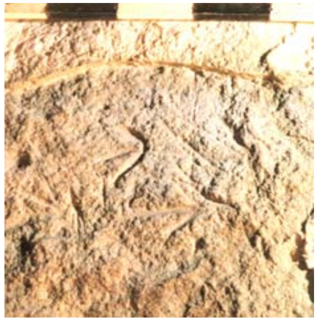
Figure 4. Ceiling of Malangine Cave, near Mt Gambier. The reprecipitated limestone lamina visible in upper part of image is exfoliating, revealing numerous petroglyphs predating it. The deposit is close to 30 000 years old, therefore this is the oldest credibly dated rock art in Australia.

Some of the Australian cave petroglyph sites have been subjected to detailed archaeological studies: Orchestra Shell Cave (Hallam 1971), Koonalda Cave (Gallus 1971; Wright 1971), Malangine and Koongine Caves (Frankel 1986, 1989) and New Guinea 2 Cave (by P. Ossa). Most of the archaeological data are not directly relevant to the art as the sites were frequented at various times; the art cannot be convincingly related to any of the occupation phases, and may in fact relate to none of them. In some cases the occupation evidence is probably much more recent than the art, e.g. in Orchestra Shell Cave, where the occupation stratum is in a deposit that formed after a floor subsidence occurred, whereas the art antedates the time of that collapse (Bednarik 1978/88).