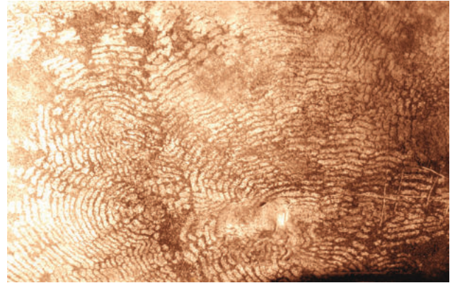
Figure 3: Partial view of the finger flutings on the ceiling of Yaranda Cave, western Victoria.

Of particular interest is Yaranda Cave, which contains, besides several deep pits and some tool marks, the most complex panel of finger flutings known in the world. Although partly lost to speleo-weathering, the panel still extends over many square metres, covering part of the ceiling of the large tunnel cave. In contrast to the random arrangement of other finger flutings, the main panel in this cave consists of a large arrangement of structured circular patterns (Figure 3). There is a second panel elsewhere in