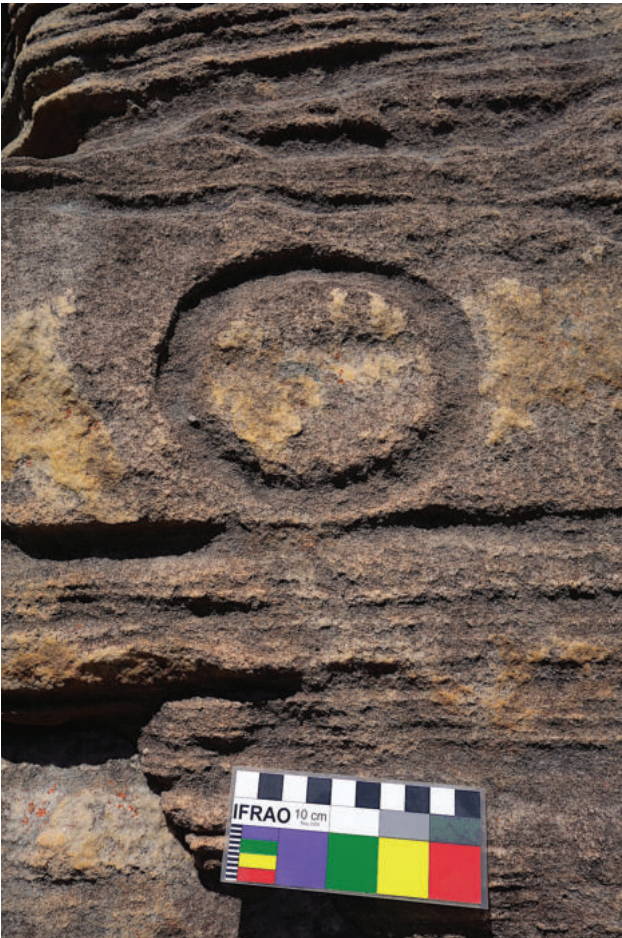
Figure 1: Natural rock marking on sandstone, resembling a circle petroglyph. Gariwerd (Grampians), western Victoria.

New Guinea 2 Cave, on the Snowy River near Buchan, has been subjected to major archaeological investigations that led to establishing the presence of Pleistocene occupation deposits (Ossa et al. 1995). The cave walls feature finger flutings as well as animal claw markings. Finger fluting is a form of cave art found in just six countries worldwide, and is produced by drawing the fingertips of a human hand over initially very soft deposits of a speleothem called 'moonmilk'. This white precipitate, mainly of calcium carbonate, can subsequently harden through desiccation and mineralisation (Bednarik 1999). Because the deposit may be subjected to various modification processes, effective identification of finger flutings can be challenging, and that was also the case at this site. Cloggs Cave nearby, as mentioned, contains a single white-painted motif, consisting mainly of the oxalate mineral weddelite (B. Birch, pers. comm.).