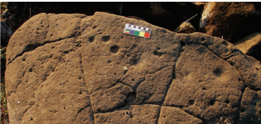
Figure 5: Cupules on basalt slab at Lake Burrumbeet.