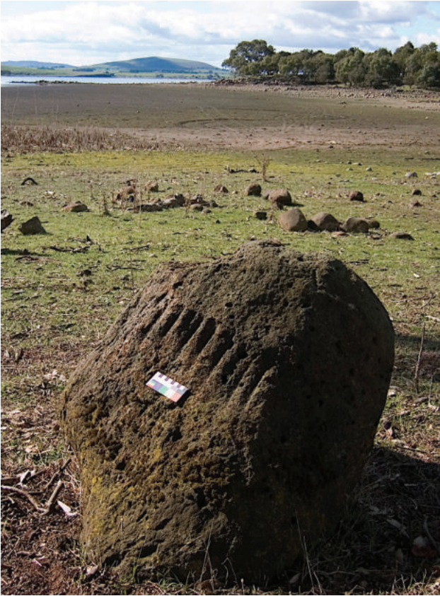
Figure 4: Petroglyphs on a block at the shore of Lake Burrumbeet, western Victoria.

placement of the grooves. Such subparallel grooves are a common feature in Australian petroglyph assemblages, but the age and meaning of this arrangement are unknown. The motif was covered densely by lichen and, judging from the nearby storm-erosion bank, was located close to the high-water mark of the lake, the water level of which fluctuates considerably. Stone artefacts can be observed in the vicinity of the site.