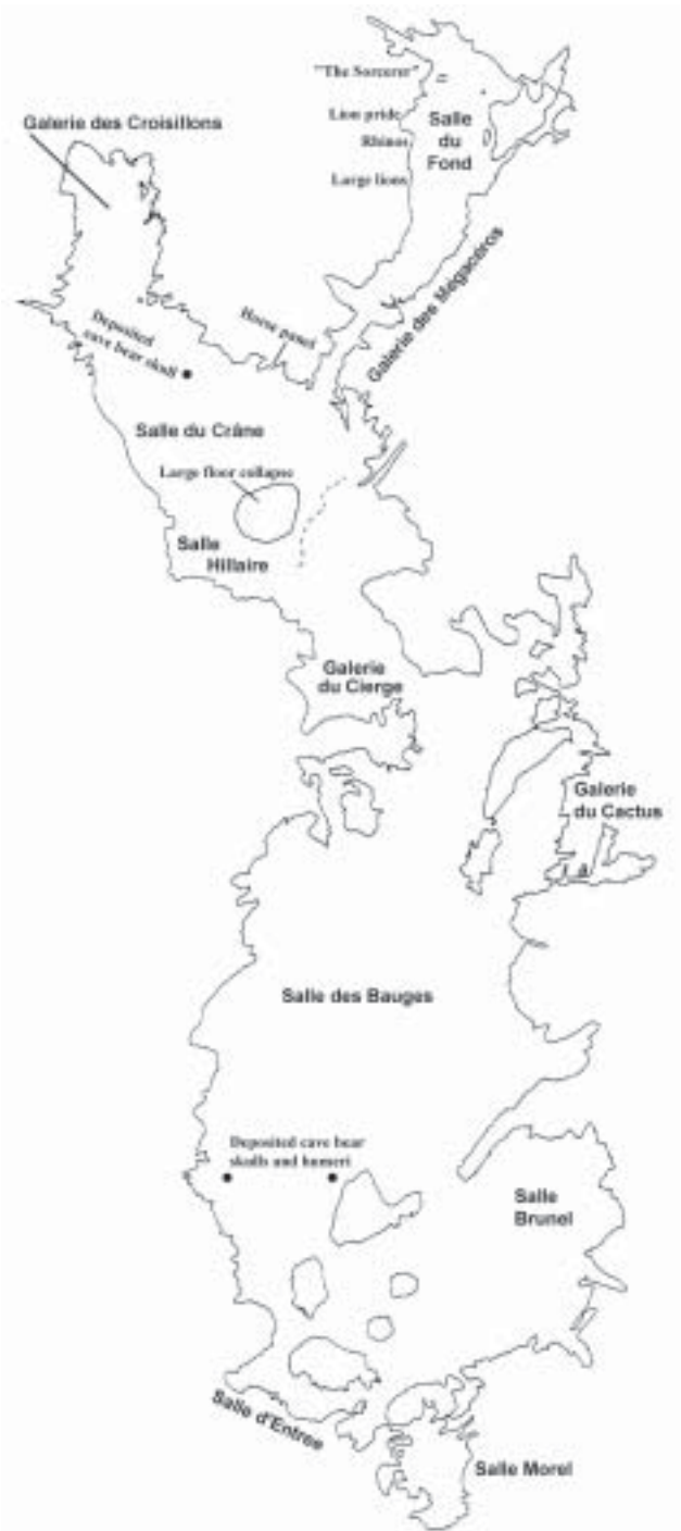
Figure 3. Plan of Chauvet Cave, showing the main features and the location of three cave bear bone arrangements.

In some parts of the cave, especially in the elevated part of the Megaceros Passage (Figure 3), there occur a good number of unusually well preserved hibernation pits of cave bears. In all, approximately 315 hibernation pits can