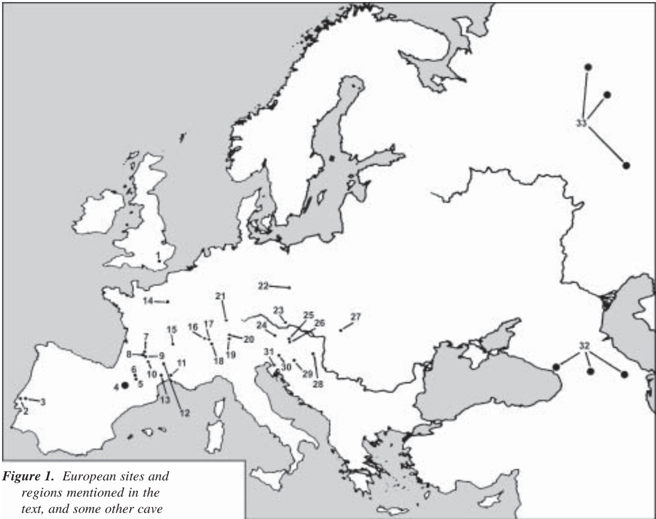
Figure 1. European sites and regions mentioned in the text, and some other cave bear lairs: