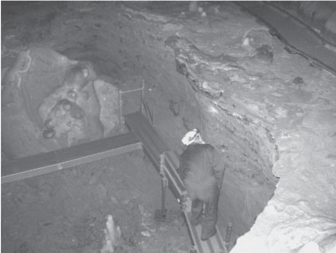
Figure 5. The author in the large floor collapse (subsidence) in Salle Hillaire, examining the sediment strata. Cave bear remains are numerous below floor level, but evidence of human presence seems to be limited to the uppermost few centimetres of the deposit, especially to the actual surface.

Therefore a key issue in the interpretation of Chauvet Cave concerns the interaction between the human and the ursine inhabitants of the site. If it were correct that some of the very ‘early Upper Palaeolithic’ (or ‘epi-Middle Palaeolithic’?) hunting societies specialised in harvesting fattened and drowsy cave bears as a relatively reliable annual food source, and perhaps attached some ceremonial practices to this activity, then Chauvet would need to be considered in that context. The preoccupation with ‘dangerous animals’, so prominent in the parietal art of this cave (Clottes 2001), is also reflected in some of the central European evidence of the same period. The therianthropes from Hohlenstein-Stadel (Schmid 1989) and Hohle Fels (Conard et al. 2003) alone should suffice to dispel any notions that the early Aurignacians lacked sophisticated beliefs and artistic abilities. They are among the conceptually most complex productions of the entire Upper Palaeolithic, and their cultural and temporal attribution is uncontested. Therefore the assertion by the detractors of the Chauvet attribution to the Aurignacian, that Aurignacian rock art “looks pretty crude and simple, a long way from Chauvet”, is profoundly false: some of the art of this period is more sophisticated than anything that followed in the next twenty millennia.