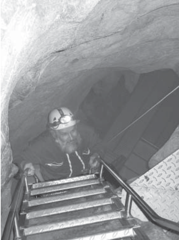
Figure 6. The author descending into the entrance shaft of Chauvet Cave.

this statement was quite prophetic. We can now state, unambiguously, that there is currently no evidence that any Aurignacian is the work of ‘moderns’, or Cro-Magnons. We have already known for some time that the Châtelperronian is a tradition of the Neanderthals. But their ornaments, we were told, were not their own work, they were scavenged from the ‘invading’ ‘moderns’. After all, Neanderthals were primitive brutes, without language, symbolism or complex social systems, how could they possibly have produced palaeoart. Suddenly, the tables have turned in the most dramatic way possible. Today we simply do not know what kind of people the Europeans were between 40 ka and 25 ka ago, but the fact of the matter is that all human remains we can securely place between the ‘beginning of the Upper Palaeolithic’, 40 000 years ago, and its middle, 15 000 years later, are considered to be of Neanderthals. If we were to assume that this is a reflection of the real circumstances, not a fluke of recovery bias, then we are led directly to some very disturbing deductions.