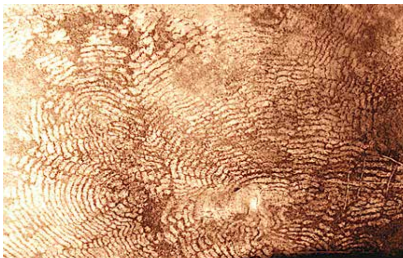
Figure 7. Complex design made of finger flutings in Yaranda Cave, probably over 46 000 years old.

In addition, many of the cave art sites have been shown to contain occupation evidence in their floor sediments. Six have been subjected to archaeological excavations: Koonalda (Gallus 1971; Wright 1971), Orchestra Shell (Hallam 1977), New Guinea II (Ossa et