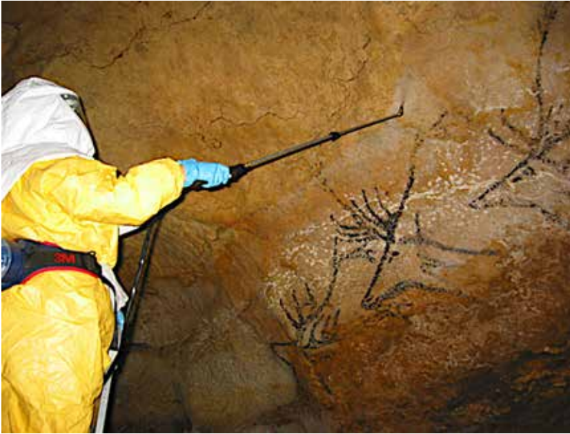
Figure 8. Addressing fungal infestation in Lascaux Cave, France.

unexpectedly recouped within three years. However, well over 40 years after the original site was closed, biologists are still battling the infestation by Fusarium and Ulocladium species at great expense (Fig. 8). Other cave art facsimiles have been established, and recently a facsimile of Chauvet Cave was constructed at the cost of US$50 million. The construction of Lascaux IV even cost US$70 million. The original Chauvet Cave is only entered by researchers. The cave art sites of France and Spain are now rigorously protected, and those of Australia are just as important and need to be preserved at a similar level.