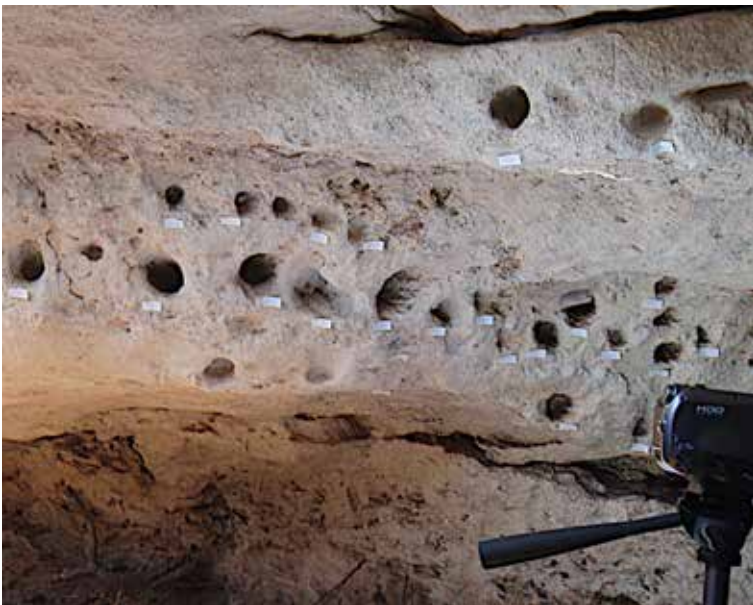
Figure 6. Deep pits or cupules in Ngrang Cave.