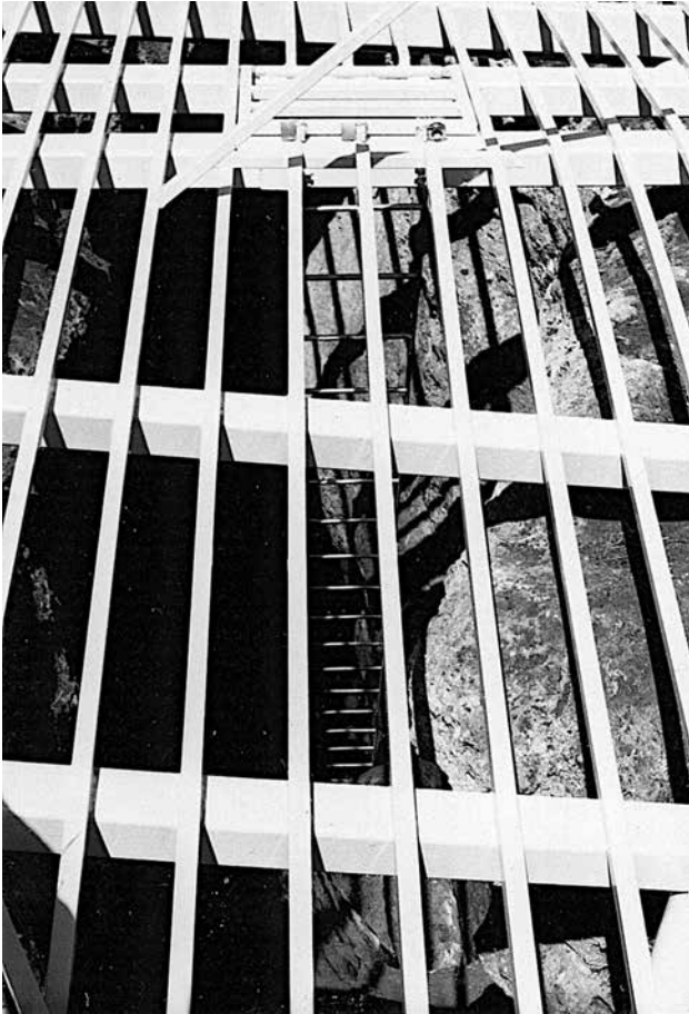
Figure 9. Paroong Cave protective structure.