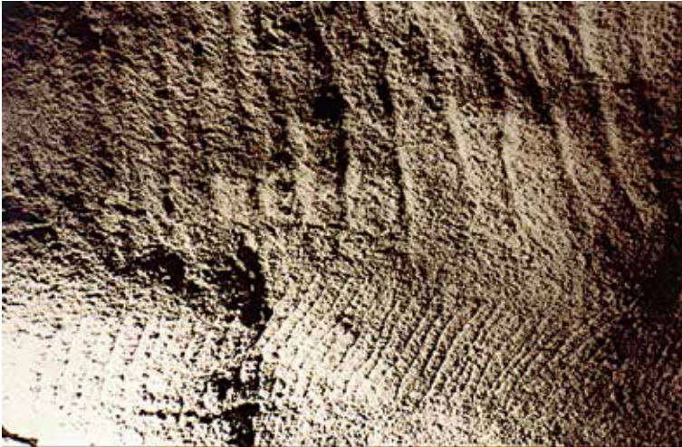
Figure 5. Tool marks in Koonalda Cave.