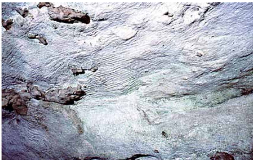
Figure 3. Well-preserved finger flutings in Prung-kart Cave.

A. Finger flutings occur on formerly soft calcite deposits, which in all but two sites are of a secondary, i.e. reprecipitated carbonate (moonmilk, Mondmilch or Montmilch ). This speleothem, consisting of a microscopic, fibre-like lattice of calcite crystals, can absorb a great deal of moisture and be as soft as snow. These white cave deposits were extensively marked (in France, Spain, Austria, Russia, Dominican Republic, New Guinea and Australia), and they survived in some cases through desiccation or carbonatisation of pore spaces (Bednarik 1980, 1999). Only 74 sites of this form of cave art are known worldwide, of which 37 occur in Australia, most of them within 80 km of Mount Gambier. The finger flutings are among the earliest forms of intentional marks on rock surfaces that have survived to the present (Fig. 3).