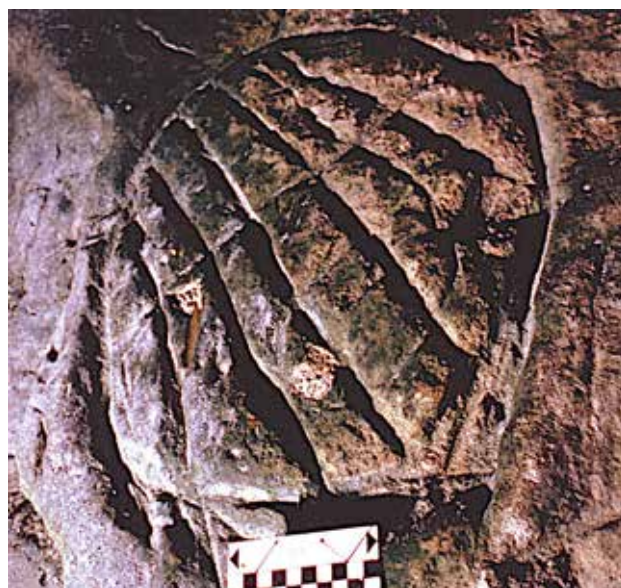
Figure 4. Deeply carved Karake genre petroglyph, Paroong Cave.

B. Karake genre : these petroglyphs are deeply abraded (up to 40 mm deep) and often probably pounded as well (Fig. 4). Circles and cell-like or reticulate arrangements dominate motif types. The circles are usually under 50 cm but may range up to about a metre in diameter, while the panels of mazes may extend over several metres. Motifs also include parallel lines, arcuate designs, 'convergent lines motifs' (including the 'trident' but also with two, four or five 'toes' which are not necessarily connected at the point of convergence), wave lines, circles with internal design (vertical barring or lozenge lattice), and radial and dot arrangements (cupules). This motif range has many parallels in other Australian rock arts, which are frequently considered to be of Pleistocene age. It is also similar to that of pre-iconic rock art globally. Several Australian sites have provided good evidence for such Pleistocene antiquity