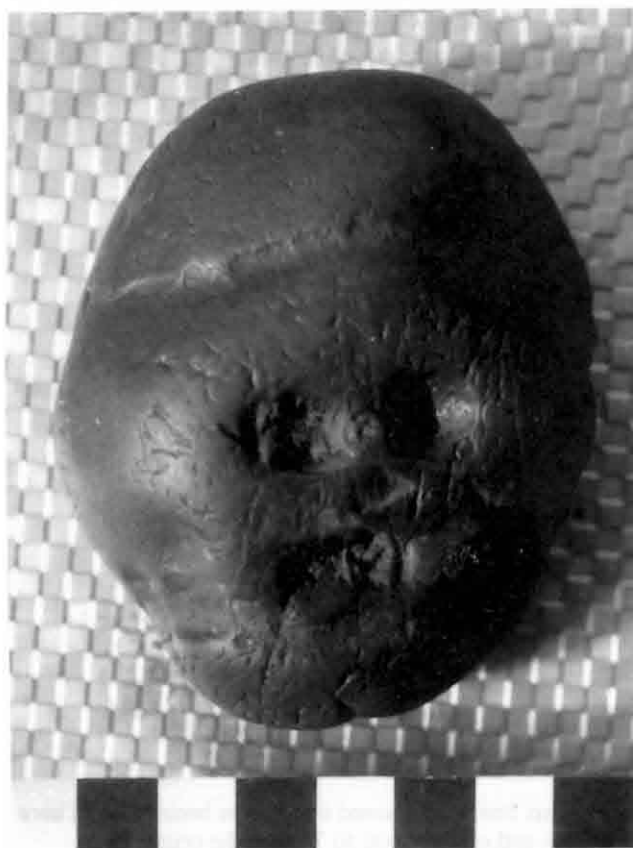
Fig. 2. The Makapansgat jasperite cobble (Scale in 100 mm intervals).