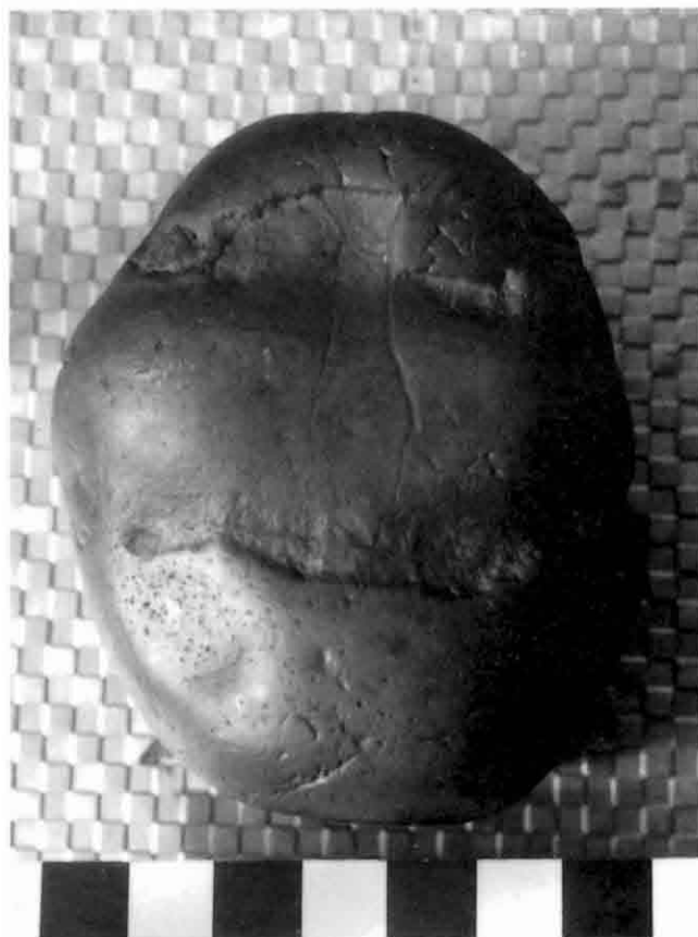
Fig. 4. The Makapansgat cobble in the orientation showing features of an australopithecine 'face'.

The visual properties of the Makapansgat cobble are so striking that some commentators have found it hard to believe that it is simply a natural product. That, however, is precisely what it is: it bears no trace of any artificial modification. Having examined vast numbers of silica nodules and other natural phenomena of often fantastic shapes, I confess that I have never seen a natural stone object with such remarkable visual properties. The symmetry of the 'eyes', in particular, especially in relation to the head-like shape of the stone, is impossible to overlook, and this feature has an almost menacing quality. I concur with Eitzman, Dart and Oakley that the object was collected by australopithecines for its visual qualities, and that its iconographic properties were recognised by these creatures. As Dart has pointed out, the face most readily perceived in the object by modern humans resembles human features, which could not have been recognised as such by australopithecines. However, when the stone is turned over, it presents a face resembling the reconstruction of an australopithecine face, wearing a friendly if somewhat mischievous grin (Fig. 4). Perhaps this was the orientation Australopithecus would have preferred, although I feel that the staring eyes are far more prominent, and in combination with the striking colour led to the object being picked up.